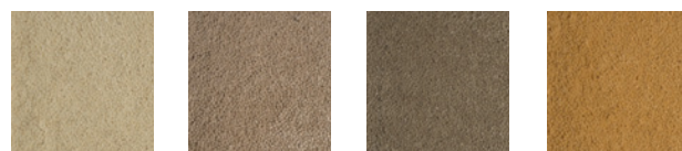
Bisque Balsa Satinwood Straw