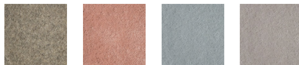
Driftwood Shell Pink Platinum Silver

Variations in size +/- 2% are inherent to hand tufted products. Dyelot variations are subject to occur in handmade products.