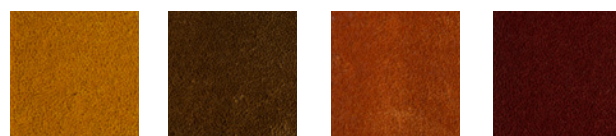
Squash Wood Siena Terra