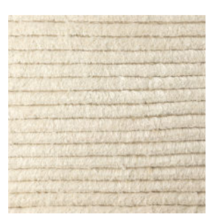
Pineapple Street Wool & Linen