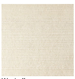
Wyckoff Wool & Silk