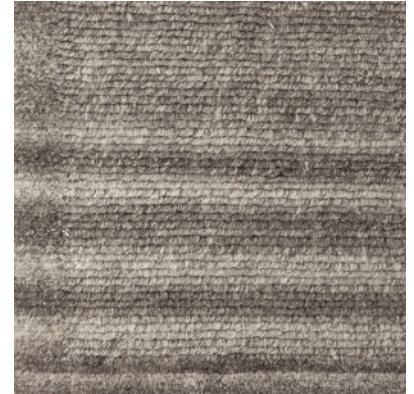
Henry Street Wool & Silk