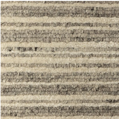
Poplar Street Wool & Silk